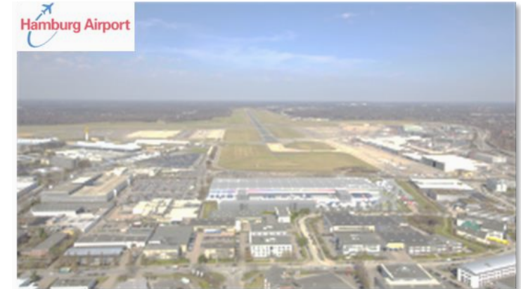
Hamburg Airport, Germany: Project Management Airport Extension Programme