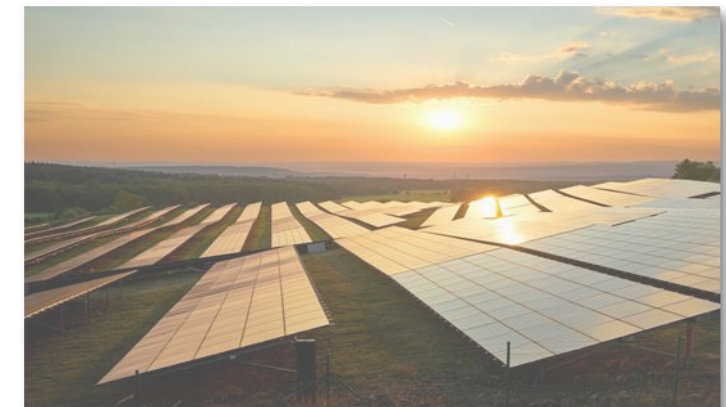
Bavaria, Germany: H2 production from solar PV