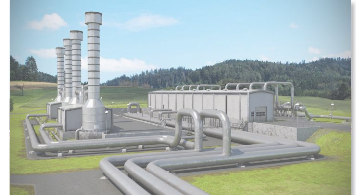
Denizli, Turkiye; Geothermal power plant with an output of 120 - 150 MW