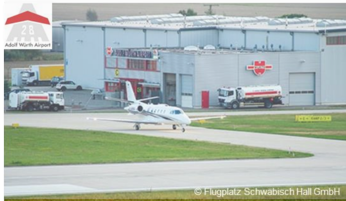
Würth Airport, Germany: Decarbonization Roadmap