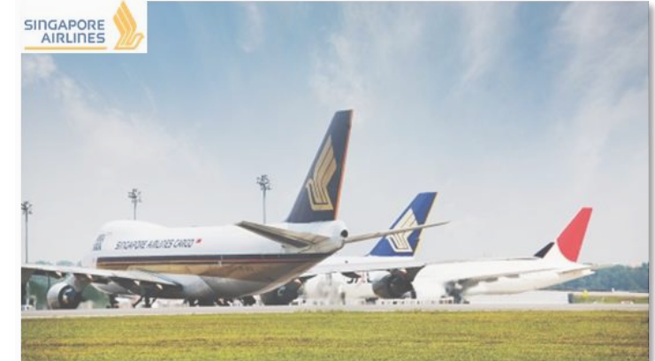
Changi Airport, Singapore: Strategy review Terminal 5 development