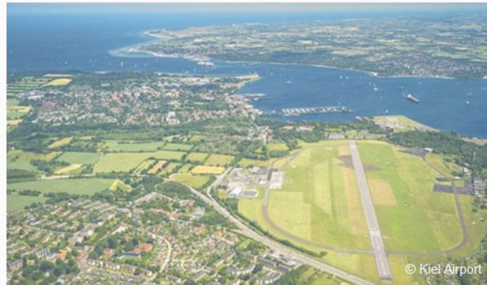
Kiel Airport, Germany: Analysis of solar energy potential