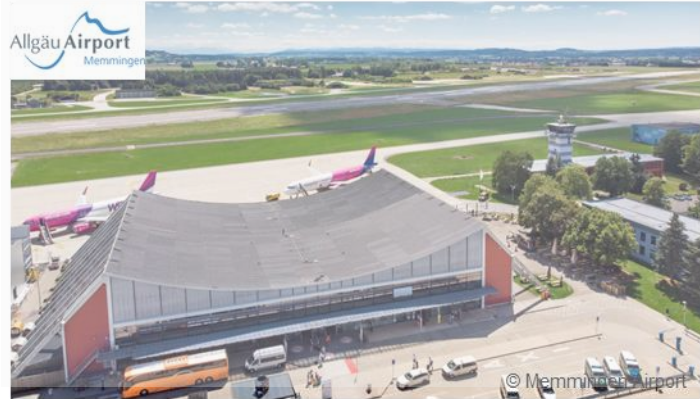
Memmingen Airport, Germany: Decarbonization Roadmap