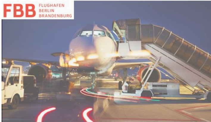
Berlin Airport, Germany: PMO for Operational Readiness & Airport Transfer