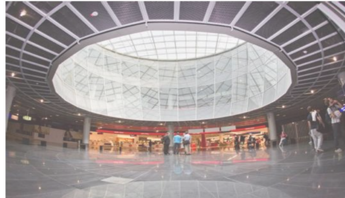
Frankfurt Airport, Germany: Project Management Lufthansa Terminal A-Plus