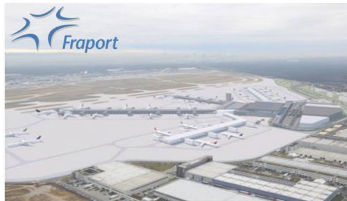
Frankfurt Airport, Germany: Strategic planning & project Management Terminal 3