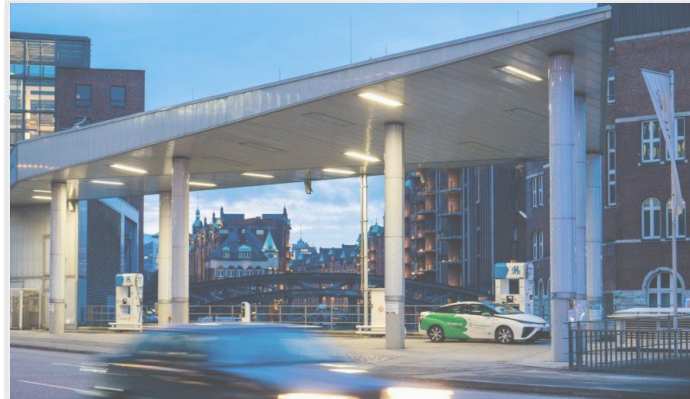
Hamburg City, Germany: Planning and construction supervision of hydrogen refuelling stations